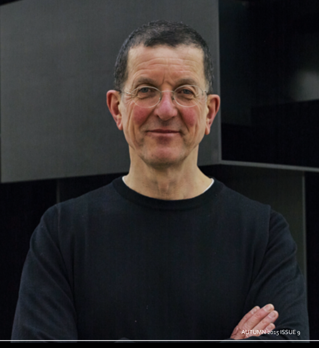
Et Cetera THE NEWS MAGAZINE OF HOLLAND PARK SCHOOL