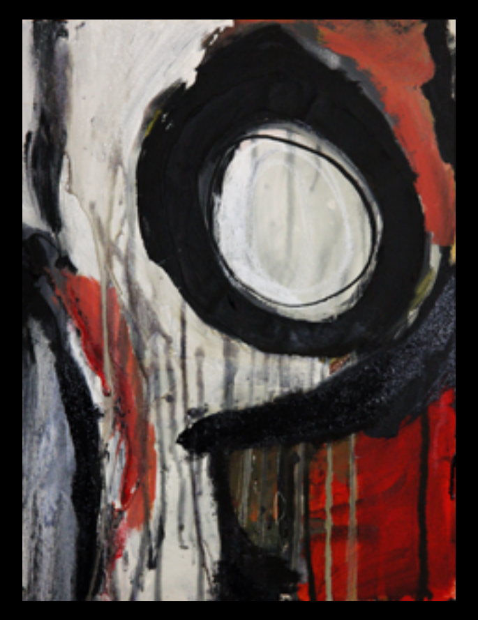
Rose Norris | Painting One, 2015 | Acrylic on canvas 30 x 20 cm